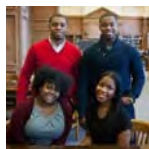
THE HOWARD PROJECT Education May Be Priceless, But A College Degree Isn't