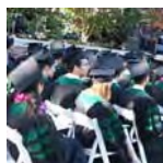
THE TWO-WAY Student Tuition Now Outweighs State Funding At Public Colleges