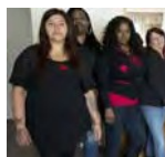
NPR ED Activists Stop Paying Their Student Loans